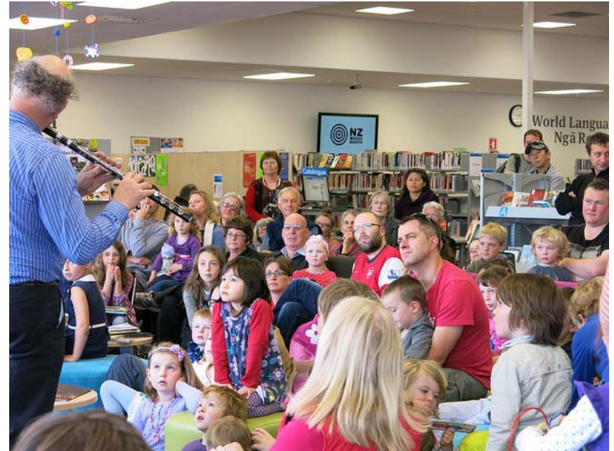
Christchurch Symphony Orchestra - NZ Music Month Central Library Peterborough.