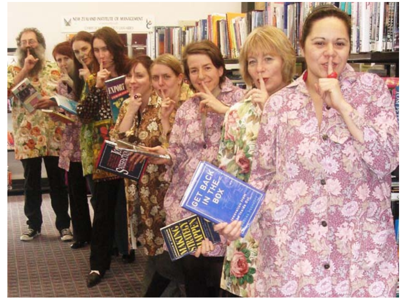
Librarians in smocks - Shush 2.0 Flickr: 31-August-2007