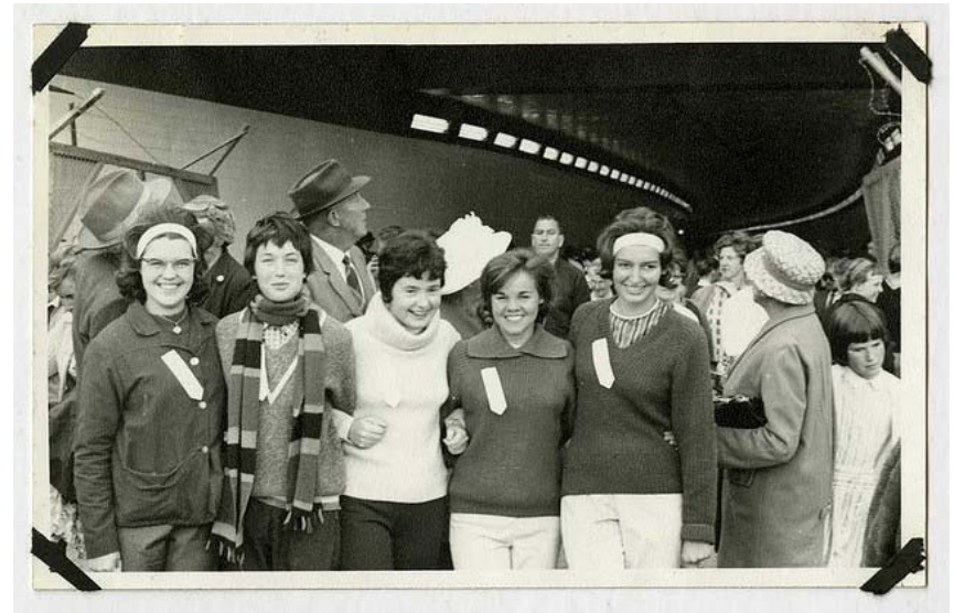
Opening of Lyttelton Road Tunnel 27 Feb 1964