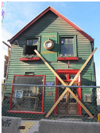
Shand's Emporium Wednesday 26 September 2012.