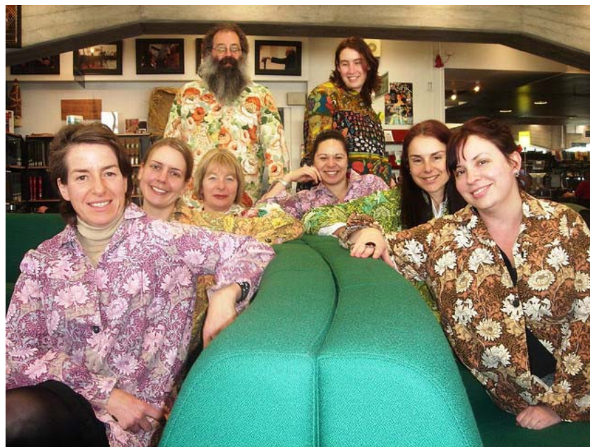
Librarians in smocks. 2007.