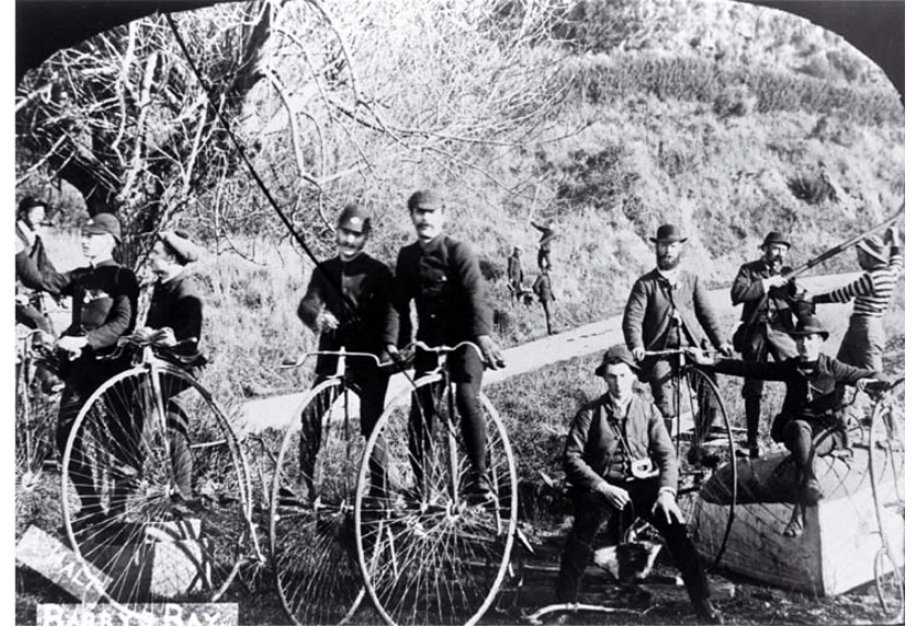
A halt on a trip to Akaroa, at Barry's Bay 1886 CCL PhotoCD 1 , IMG0065

See: New Regent Street , Majestic Theatre , International Talk like a pirate day