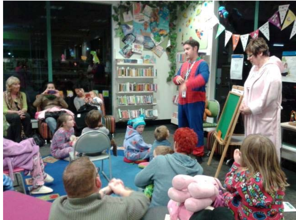
Pyjama party at Shirley. 21 May 2014. Facebook post.