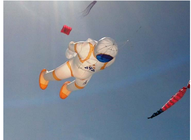
New Brighton kites. 31 January 2014. Facebook post.

Kids blog 161,368 views (1225 posts, 1035 followers)