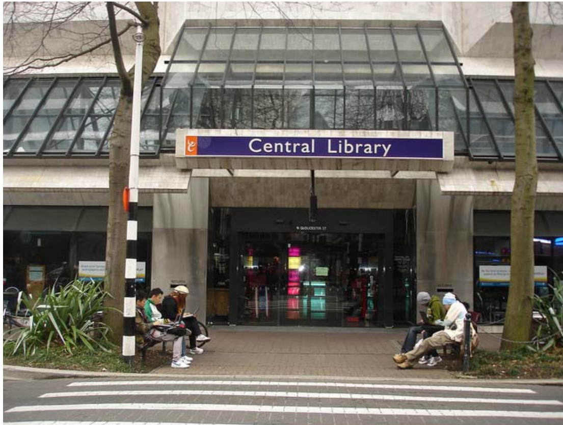
WiFi users outside the Central Library, 7 September 2010.