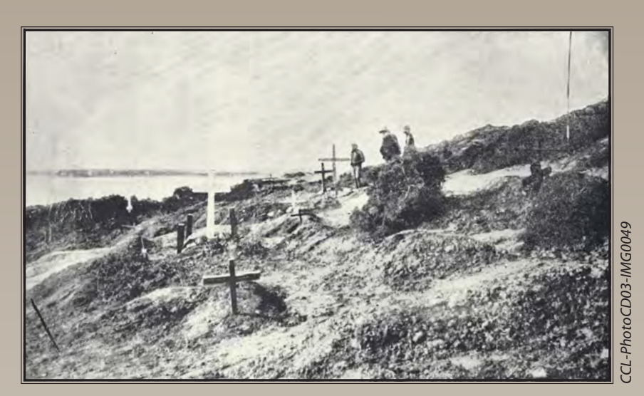
Graves of officers of the Australian and New Zealand Army Corps on the Gallipoli Peninsula [1915].

On 25 April 1915 New Zealand troops engaged in action on the Gallipoli Peninsula in a failed attempt to relieve the stalemate on the Western front. For the first time the Māori Contingent was allowed to engage in active combat as reinforcements from their base on North Beach, subsequently known as "Māori Pa". Plagued by poor planning and lacking sufficient resources, the campaign made little impact against a seriously underestimated Turkish enemy defending a rugged landscape. For eight months, soldiers from New Zealand, Australia, Britain and France battled in horrendous conditions in an inhospitable and impenetrable landscape.