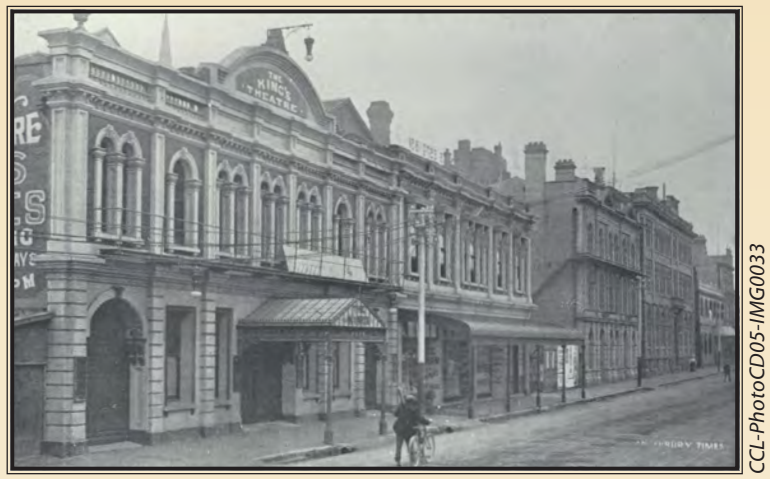
The south side of Gloucester Street, Christchurch [1910].

In 1914 Canterbury had a population of only 184,472 people and 65% lived in towns. The wages were about average for the country with many salaries including food and accommodation. Christchurch was gradually moving from being mostly wooden to brick and stone buildings. Trams were used for transport around the city while Canterbury towns were served by rail branch lines which transported passengers and goods. Shops like Ballantynes were well-established and numerous musical organisations like choirs and orchestras were active in the city.