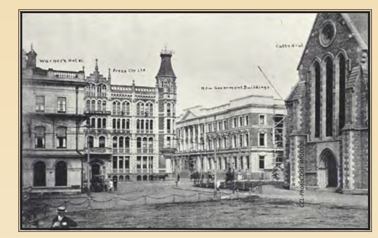
A portion of the Eastern side of Cathedral Square [1913].

During this period Ngāi Tahu were working on Te Kerēme (the Ngāi Tahu Claim). The government established a Commission of Enquiry in 1914, but