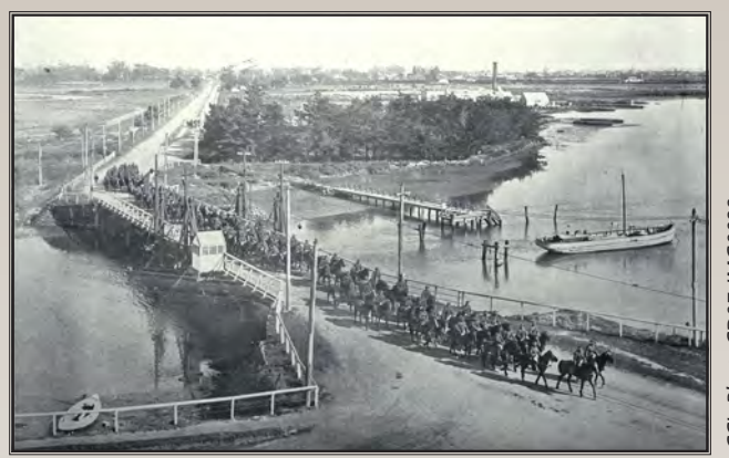
Members of the B Squadron of the Canterbury Mounted Regiment crossing the Heathcote Bridge, Ferry Road, on their way to Lyttelton [23 September, 1914].

formed part of the NZ Mounted Brigade and served in Gallipoli, Egypt and Palestine. On 23 June 1919 the last of the regiment left Egypt for good and returned to New Zealand. For a variety of reasons including quarantine rules only 4 of the more than 10,000 horses that were shipped out of the country for war use (some by the Canterbury Mounted Rifles) were brought back. 340 men of the regiment were killed during the First World War.