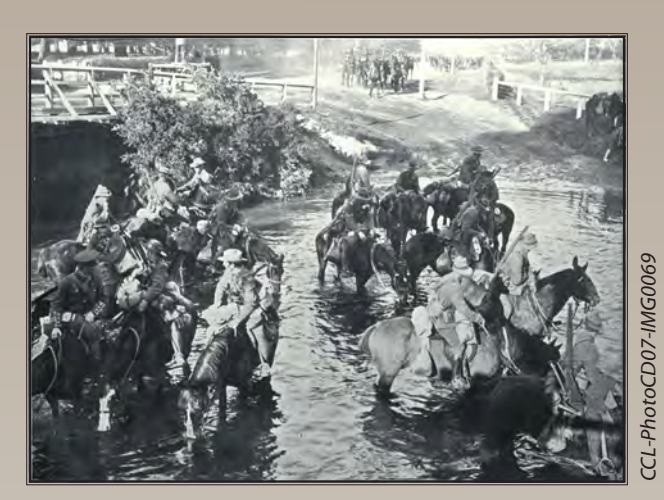
Troops watering horses in the Avon River near Carlton Bridge, Christchurch [23 September, 1914].

The regiment was equipped and trained at Addington and Sockburn until 23 September 1914. In the early hours of the morning