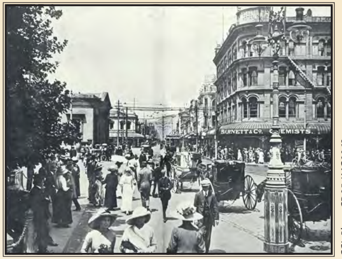
Busy Christchurch: a view in Cathedral Square looking towards the BNZ corner on a hot summer's day [1913].

The labour movement in Christchurch in 1914 was one of the strongest in the country, both politically and in the workplace. Christchurch working-class political and industrial organisations were increasingly active, protesting the new industrial legislation, new methods of working that undervalued the skilled worker and compulsory military training. The