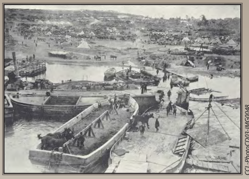
A view of Beach V, one of the initial landing points for troops, Gallipoli Peninsula [1915].