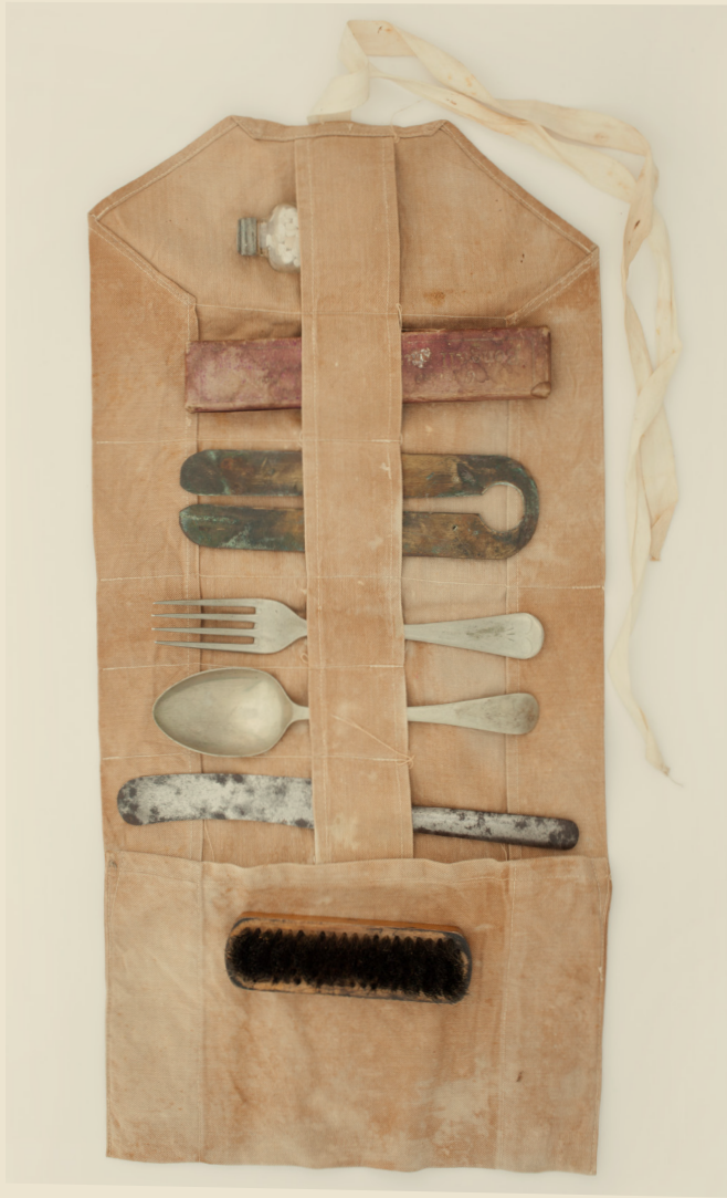
Holdall with personal items. Barry O'Sullivan collection. CCL-O'Sullivan-4085-004