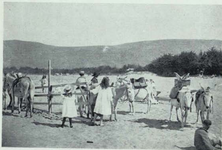
Sumner on the Sands, 1896.

of the petitioners be granted." The alterations in the Borough boundary were gazetted on the 30th March, 1921, and Mount Pleasant became part of Heathcote County on the first day of April of the same year.