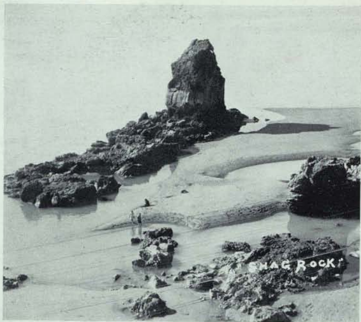
"Rapanui" (Shag Rock)