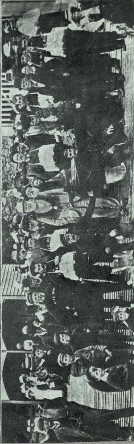
Top: A view of Redcliffs. Bottom: Launching of the "Aid", February 25, 1909.