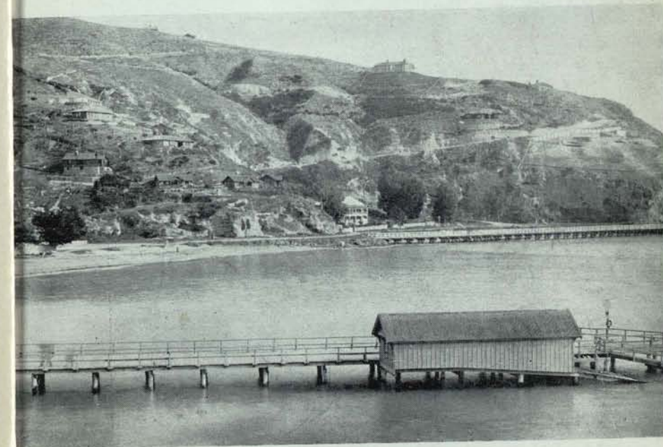
An early view of Clifton and the Pier, 1910.