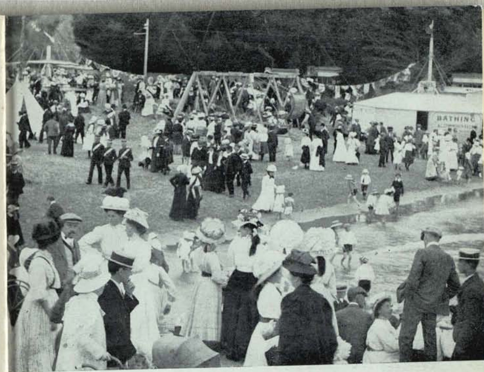
Fashions of yesterday; Sumner Gala, January 23, 1909.

Reserve 69. By Crown grant, dated 20th September, 1855, this Reserve was vested in the Superintendent of the Province, James Edward Fitzgerald, on the 23rd of December, 1868. He conveyed it to the Church Property Trustees pursuant to the Public Reserves Act, 1854, to hold upon trust for a site for a church, parsonage, schoolhouse and cemetery for members of the Church of England of the district for the purposes set out or any of them.