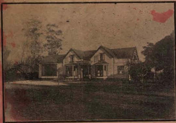
ELMSDALE SPECIAL SCHOOL, TIMARU (Established 1917)

ELMSDALE is a Boarding School for a limited number of backward and delicate children requiring more individual care and teaching than can be obtained in the ordinary school.