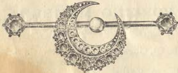
Diamond, Sapphire and Pearl Crescent Brooch, £16 10s.