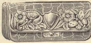
Real Lizard or Crocodile Skin Silver Mounted Purse, 30/- Endless Variety of others, from 8/6