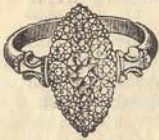
Diamond Marquise Rings £14 10s. to £45