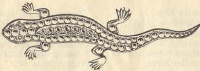
LIZARD BROOCHES. Set Diamonds and Sapphires, £15 " " " Rubies, £17 10s. " " " Emeralds, £30