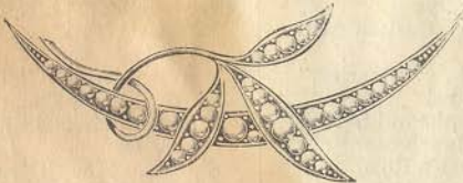
15ct. Gold Brooch, set with Finest Pearls, £6 10s.