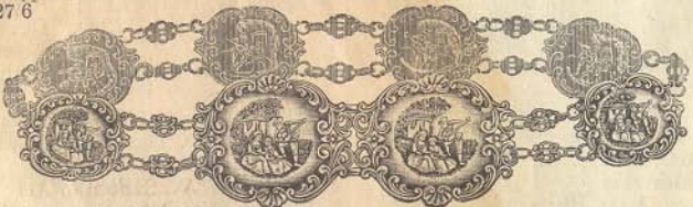
Ladies' Sterling Silver BELTS, various designs, 45/- to 70/- Other Patterns in Silver-Plated Ware, 14/6, 16/6 and 18/6

STEWART, DAWSON & CO. 236 and 238, High Street, Christchurch.