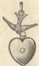
Pearl and Turquoise Pendant 10/6