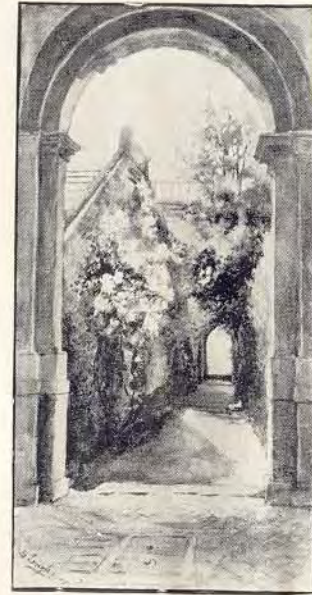
No. 224. VILLA D'ESTE, TIVOLI. B. LOUGHNAN.