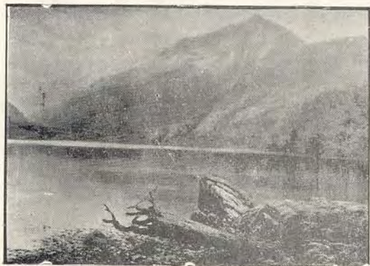
No. 349. A GLEAM OF SUNSHINE, RERI LAKE.