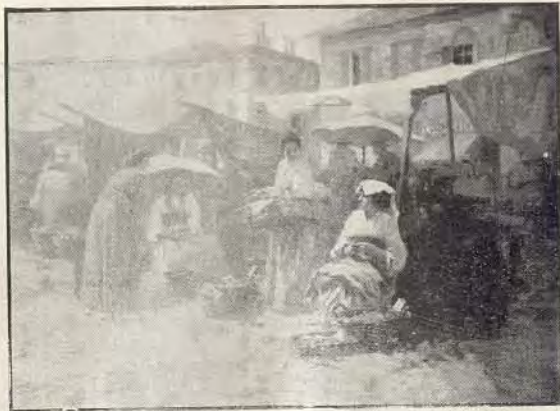
No. 127. GOSSIPS, MARKET SCENE, ROME. R. PROCTER.