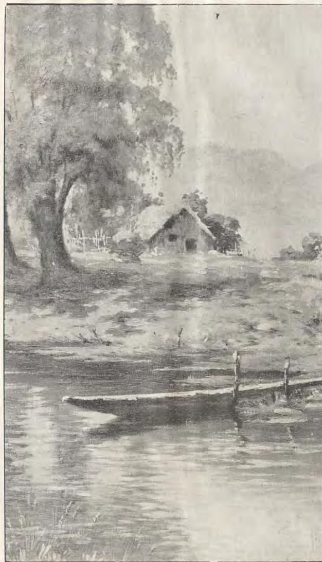
No. 49. HAMURUNUI, ROTORUA.