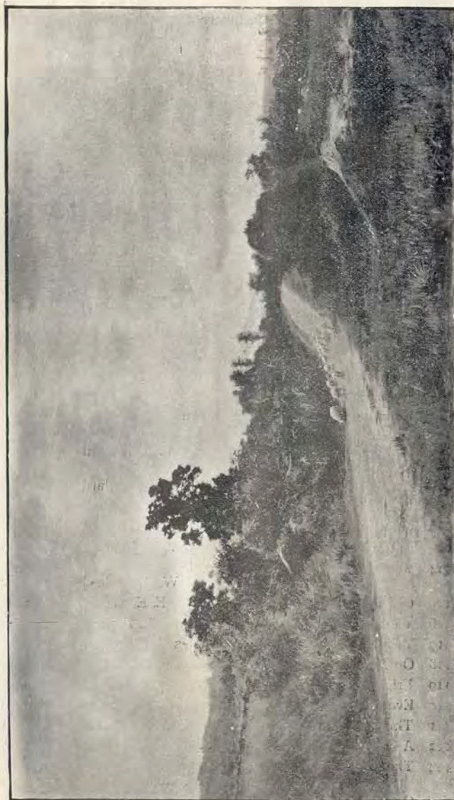
W. MENZIES GIBB.