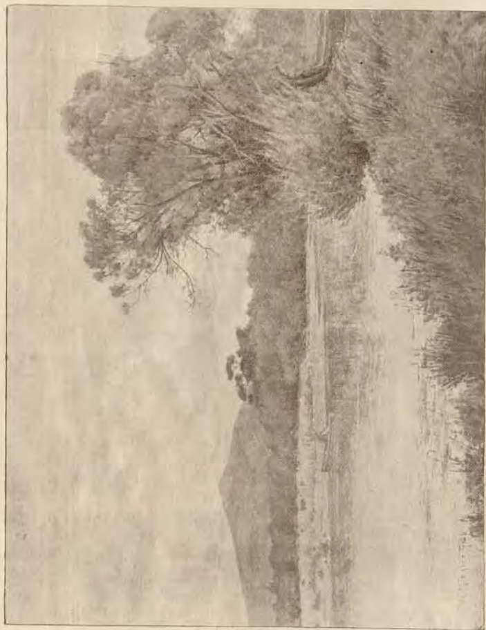
THE BANKS OF THE AVON.