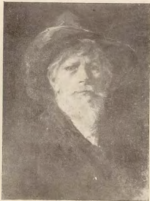
129. A PORTRAIT STUDY. P. VAN DER VELDEN