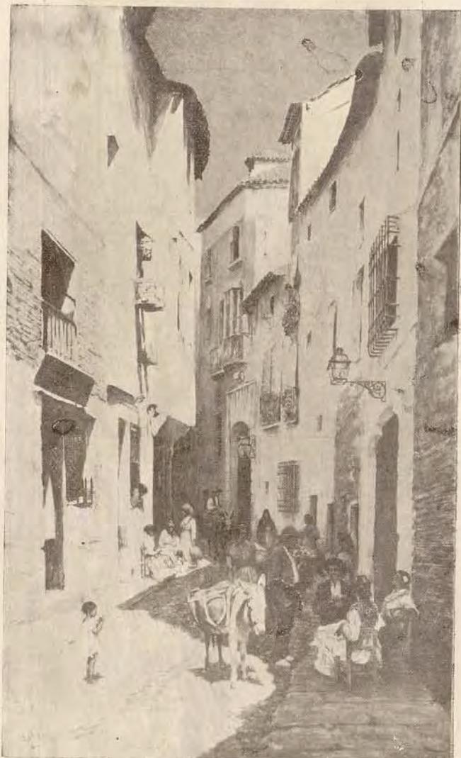
145. LIFE IN A SPANISH STREET. C. N. WORSLEY