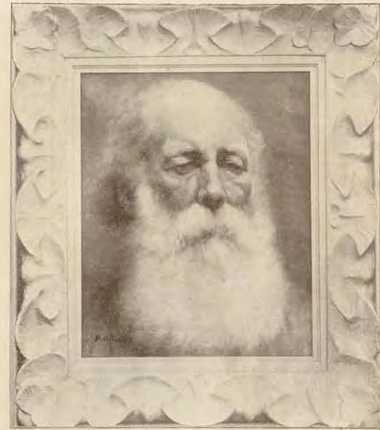
115. AN IMPERIAL PENSIONER. A. O. RAINE