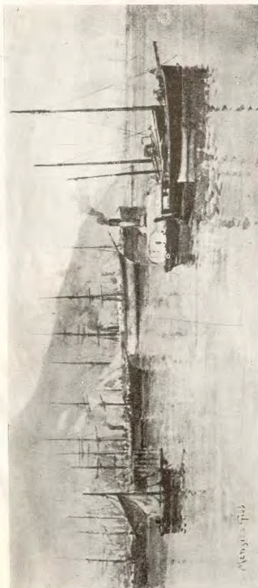
W. MENZIES GIBB.