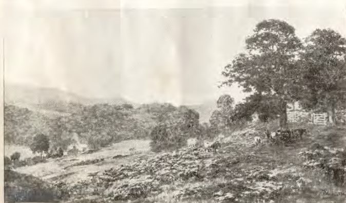
LAKE WINDERMERE, CUMBERLAND. C. N. WORSLEY.