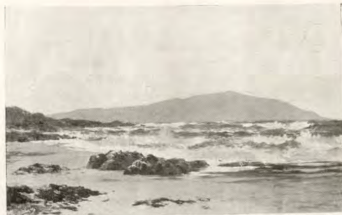
75 FINE WEATHER—FOVEAUX STRAITS.