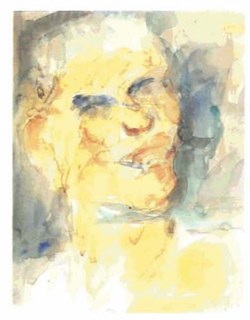
Woollaston, M. Apparition of a man, 1964.