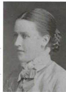
University of Canterbury