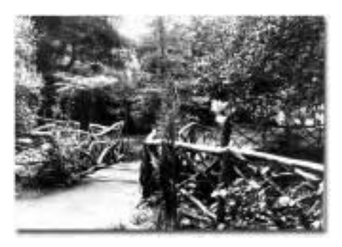
Millbrook Reserve, 1920s

'He was a man with tremendous organising ability, a man of great vision. He could not suffer fools and one of his great