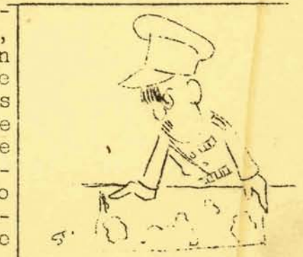
so there n. Z! Where the hell do they go when the tide comes in?

manding Officer, and to the offi-T cers and men under your command, my warmest congratulations on having been chosen to comprise the main body of this Dominion's force for service overseas. The prompt response of all those leaving to-day to answer the nation's call is a further proof to the world of the unwavering devotion and lovalty of the people of this country to King and Empire, and the spirit which has imbued all concerned to attain the maximum degree of efficiency within the minimum time, is in